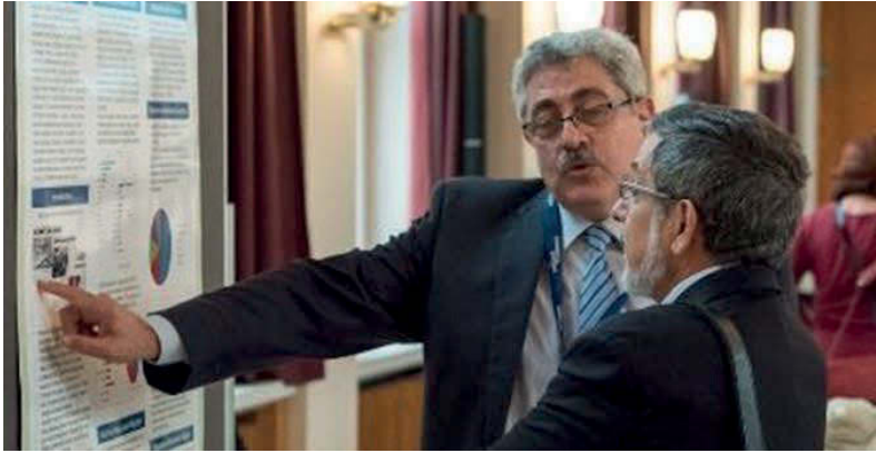
In the dialog: The exceed conference brought together scientists across many disciplines