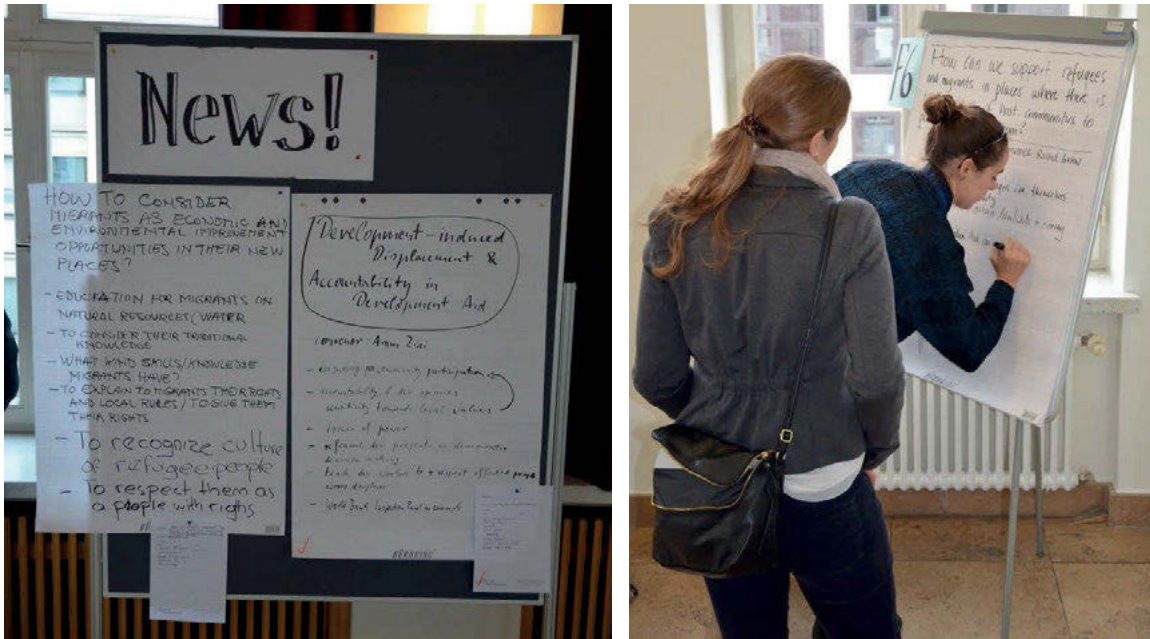
Figure 3: Notes of the exploratory sessions for review

After the exploration phase, the action phase started. At the beginning, participants were given the chance to review the notes of the exploration phase (Figure 3) and to brain-storm about which topics might be linked. After that, in a 2nd market place, the final projects were suggested to be worked on after the conference. These were then discussed during a 90 minute session during which project goals and next steps were defined on premade forms. Results were then presented to the whole group.