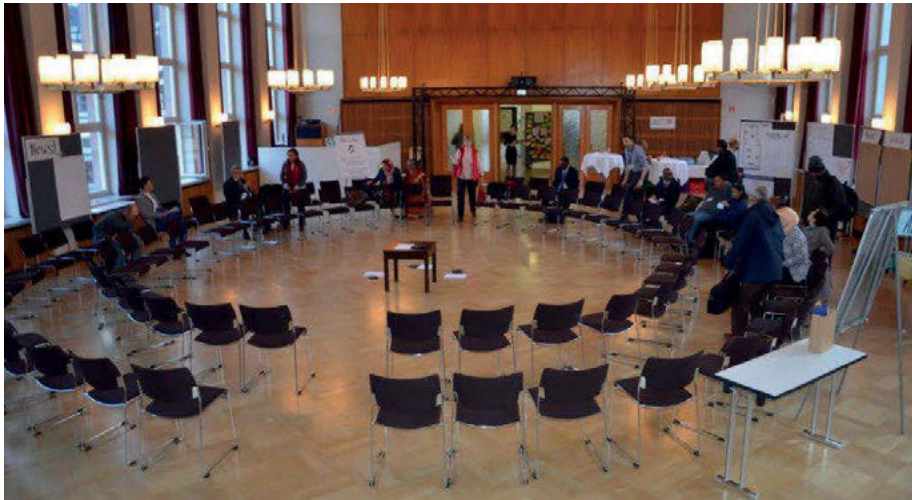
Figure 1: Setting at the start of the open space with Market Place

The day started with a welcoming session during which the objective, principles and structure were explained to the participants. For this session, chairs were arranged in a big circle. In the centre of the circle, big sheets of paper and markers were arranged, on which participants could then suggest topics to be discussed in the following three exploration phases (10-11, 11-12, 1-2 pm). These 28 topics were then sorted by time in the market place (Figure 1) so that each exploration phase had a similar amount of topics to be discussed.