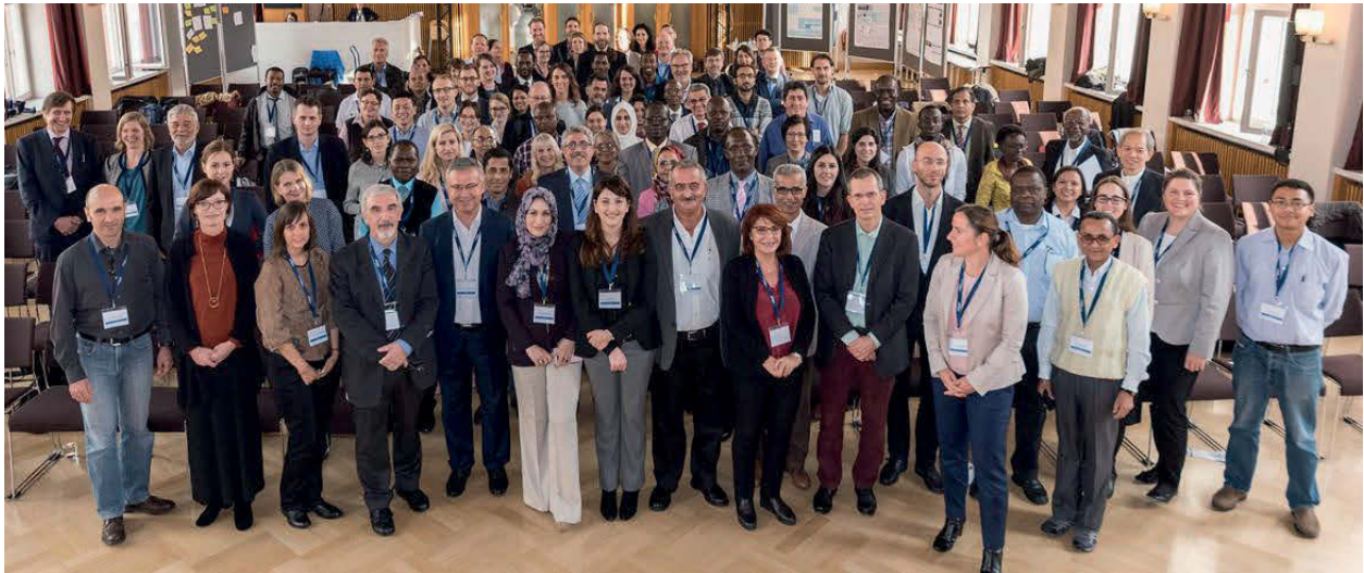
Group picture of participants of the exceed conference "Forced Migration - environment and socioeconomic dimensions"

With the "exceed" program, the DAAD is funding academic excellence and international cooperation in exceptional dimensions through funding from the German Federal Ministry for Economic Cooperation and Development (BMZ): Five German universities are cooperating with 37 partner institutions in Africa, Asia and South America. The value of this exchange with regard to the topics of flight and migration has now been elucidated by a conference in Berlin.