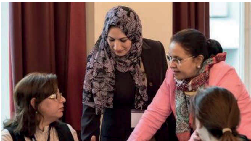
In the search for answers: pressing questions of the present were discussed in Berlin by the conference participants