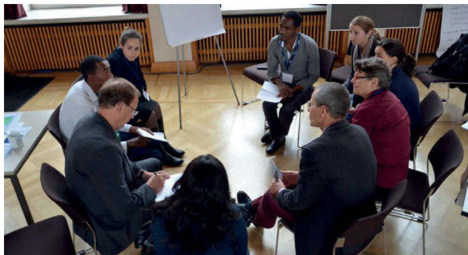
Figure 2: Group discussion during the exploration phase

During the three sessions of the exploration phase (Figure 2; 1 hour each, interrupted by a 1 hour lunch break), 23 of the 28 suggested topics were discussed and reported back (Table 2). Ten of them focused on prevention of migration while the remaining 13 focused on improvement of the situation for refugees. They covered flight related employment aspects (n=4), environmental concerns (n=2), health conditions and nutrition (n=4), social and socio-economic aspects (n=5) and political questions (n=4). Also discussed by two groups was the question of what Higher Education Institutions might contribute in terms of research, training and development aid. Topics were suggested by partners from thirteen different countries; 16 of the topics by partners outside Germany. All Exceed centers suggested different topics. Group size varied between 2 and 22 participants.